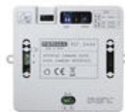
F09444 DUOX PLUS CAMERA INTERFACE