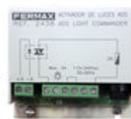
F02438 VDS LIGHT/BUZZER ACTIVATOR