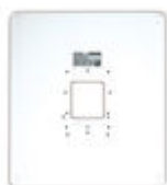
F03389 UNIVERSAL FRAME LARGE