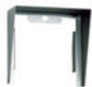
F08400 CITY SINGLE HOOD S1