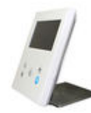
F09420 VEO-XS/VEO-XL MONITOR DESKTOP SUPPORT