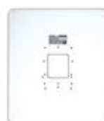
F03389 UNIVERSAL FRAME LARGE