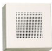
F02040 ELECTRONIC EXTENSION CALL